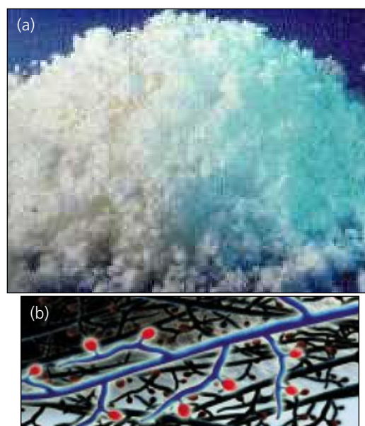
Fig. 1. (a) Smopex ® , a fibrous material with a polypropylene or viscose backbone; (b) Schematic representation of the functional groups (red) located on the surface of the Smopex ® fibres (3)

The choice of scavenger for a particular process depends on several factors. These include the oxidation state of the Pd catalyst, the nature of the solvent system (aqueous or organic), the presence of byproducts or unreacted reagents in solution and whether