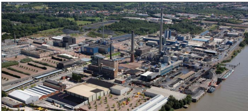
Fig. 1. Umicore, at its integrated smelter-refinery in Antwerp, Belgium

Such challenges exist, especially for complex products such as vehicles and computers. Effective recycling requires a well-tuned recycling chain, consisting of different specialised stakeholders, starting with the collection of old products, followed by sorting/dismantling and preprocessing of relevant fractions, and finally recovery of the metals. The latter requires sophisticated, large-scale metallurgical operations. For example, Umicore, at its integrated smelter-refinery in Antwerp, Belgium ( Figure 1 ), currently recovers and supplies back to the market via its main process route